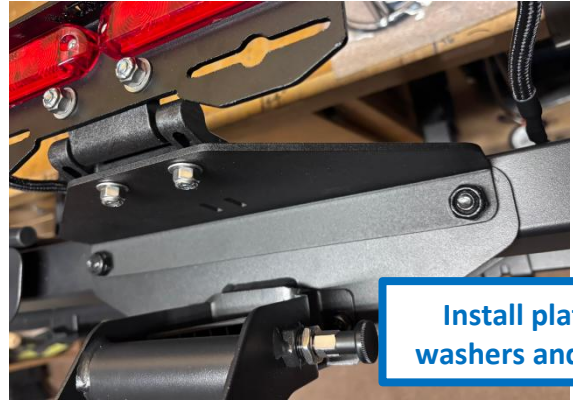
Install plates, washers and nuts