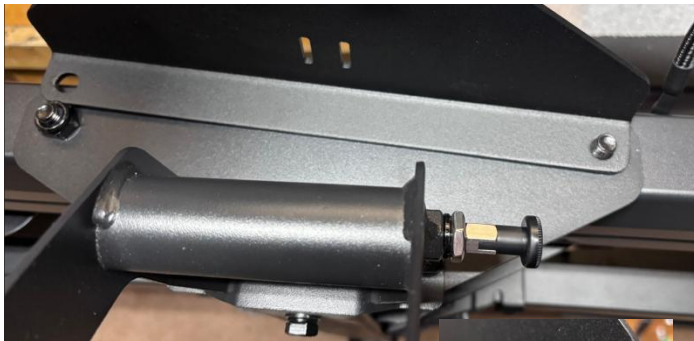
Light set in place and nut installed.