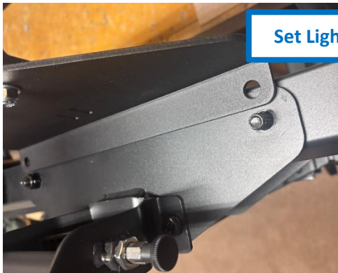
Set Light and Center